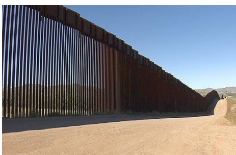
The border wall under construction between the United States and Mexico