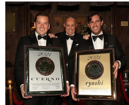
Restaurant Ryoshi Group has received the Six Star Diamond Award in 2021