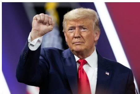
Former President Donald Trump