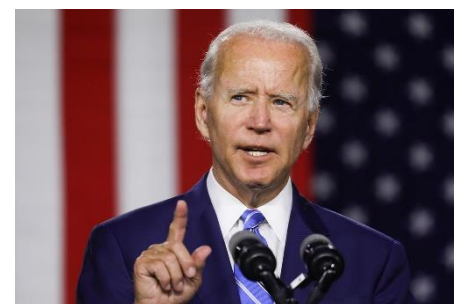
President Joseph Biden

On the other hand, in Japan, there is currently an ongoing trial at the Nagoya District Court (Aichi Prefecture, Japan) concerning the death of a Sri Lankan woman who was detained at the Nagoya Regional Immigration Services Bureau for illegal stay and died in March 2021 after complaining of health problems and not receiving necessary medical care. The surveillance footage reportedly includes the laughter of the guards, showing immigration officers (public servants) surrounding the weakening foreign woman, sometimes smirking and becoming bystanders without offering help. This response has been criticized both domestically and internationally. The bereaved family expressed their anger, saying, “My sister was treated like an animal and killed. There was no humane treatment at all. All foreigners (non-Japanese) should see this.” A professor at the national University in Tokyo commented, “If this is not a murder with indirect intent, it is likely professional negligence resulting in death. It is an irreparable act not only to the person herself but also to her family. Both the on-site staff and the top officials cannot escape with only minor penalties.”