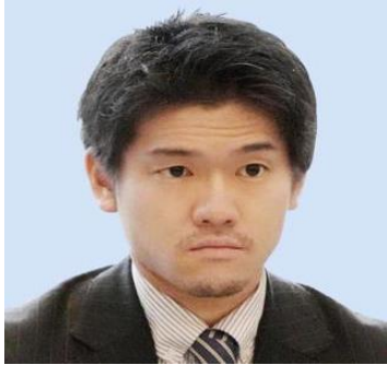
“Part-time Job Terrorist”