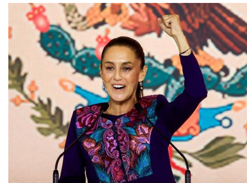
New President of Mexico Claudia Sheinbaum