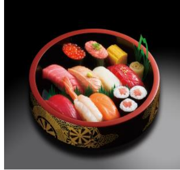
Delivery Sushi “Utage (Dinner Party)”

Bachelor of Laws from private Keio University