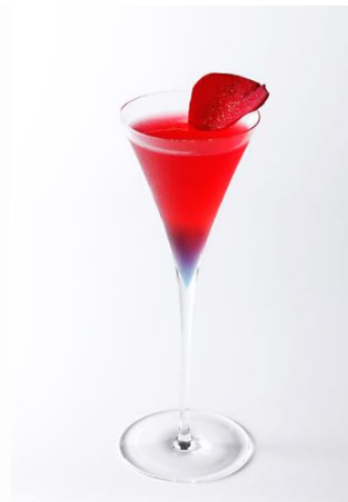
New Original Cocktail: “ New Stage ~A New Dawn~ ”