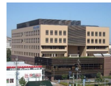
Nagoya District Court

On the other hand, in Japan, there is currently an ongoing trial at the Nagoya District Court (Aichi Prefecture, Japan) concerning the death of a Sri Lankan woman who was detained at the Nagoya Regional Immigration Services Bureau for illegal stay and died in March 2021 after complaining of health problems and not receiving necessary medical care. The surveillance footage reportedly includes the laughter of the guards, showing immigration officers (public servants) surrounding the weakening foreign woman, sometimes smirking and becoming bystanders without offering help. This response has been criticized both domestically and internationally. The bereaved family expressed their anger, saying, “My sister was treated like an animal and killed. There was no humane treatment at all. All foreigners (non-Japanese) should see this.” A professor at the national University in Tokyo commented, “If this is not a murder with indirect intent, it is likely professional negligence resulting in death. It is an irreparable act not only to the person herself but also to her family. Both the on-site staff and the top officials cannot escape with only minor penalties.”