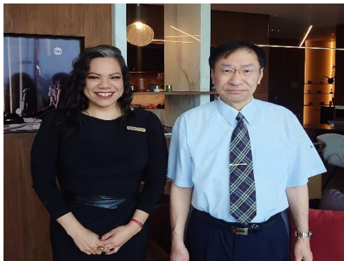
Assistant General Manager